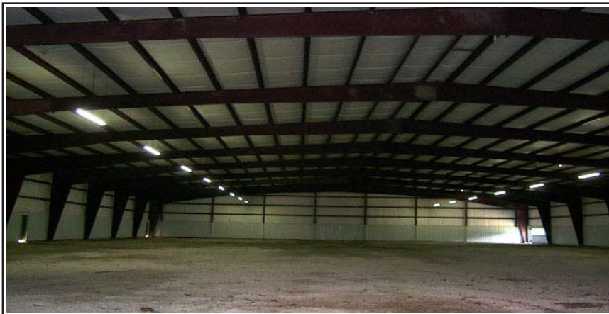
Interior view of the Breathitt County Spec Building