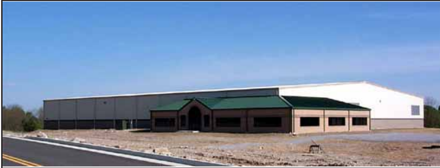
Exterior photo of the Honey Branch Spec Building in Martin County