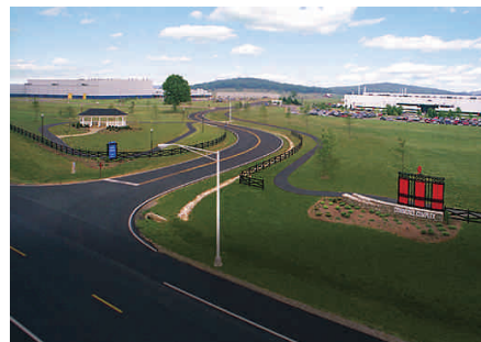
The Valley Oak Commerce Complex is a thriving industrial park located directly across from the Technology Complex.