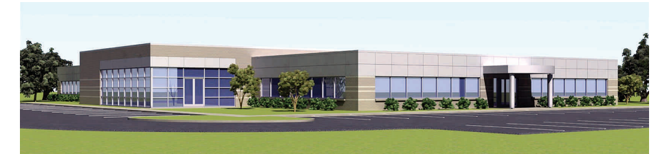
The Somerset Enterprise Center is a 20,000 SF state-of-the-art business facility in the Valley Oak Technology Complex. It has six suites ranging from 985 to 4,700 SF. Visit our website for details.

Bluegrass State Skills Corporation offers reimbursement of up to 50% of training costs not to exceed $500 per Kentucky-based employee or $100,000 per company during a BSSC biennium.