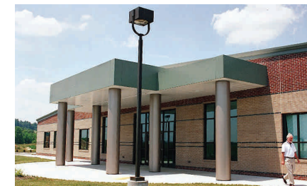
SAIC began operations at the Valley Oak Technology Complex in 2005.

We've got great people with great potential and funds to train workers to meet any requirements.