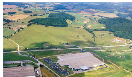
Aerial view of the Technology Complex and part of the Commerce Complex in the foreground.

The Complex's telecommunications infrastructure goes well beyond what would be considered normal for a rural location. Telecommunication providers to Valley Oak Technology Complex offer essentially unlimited levels of bandwidth and can quickly build out to the requirements of most businesses. The Complex is served by a nationally recognized local provider with SONET reliability, a regional "back-haul" leased-line fiber carrier, numerous independents and a non-profit private provider which is co-located with AT&T. A 48-strand fiber cable rings the Complex and provides connectivity from provider to tenant and also tenant to tenant. The Complex's telecommunications infrastructure is managed and maintained on a 24•7•365 basis by a highly secure Network Operations Center in partnership with the Somerset Pulaski County Development Foundation.